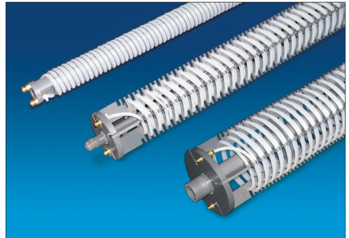
1.8", 3.8" & 5.8" Waterloo Emitters